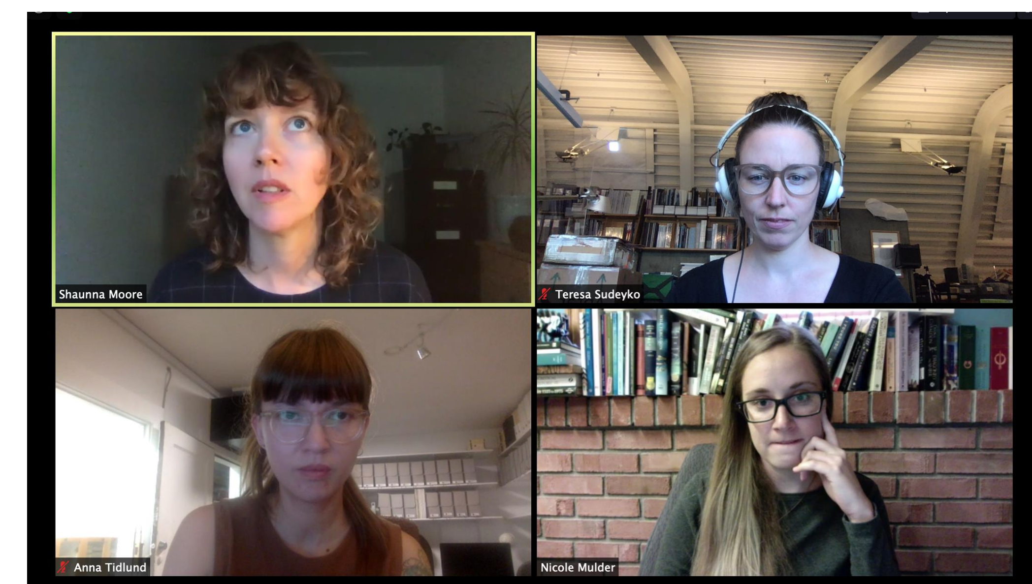
Figure 3. Zoom meeting with members of the Belkin's database project team. Screenshot taken September 10, 2020.